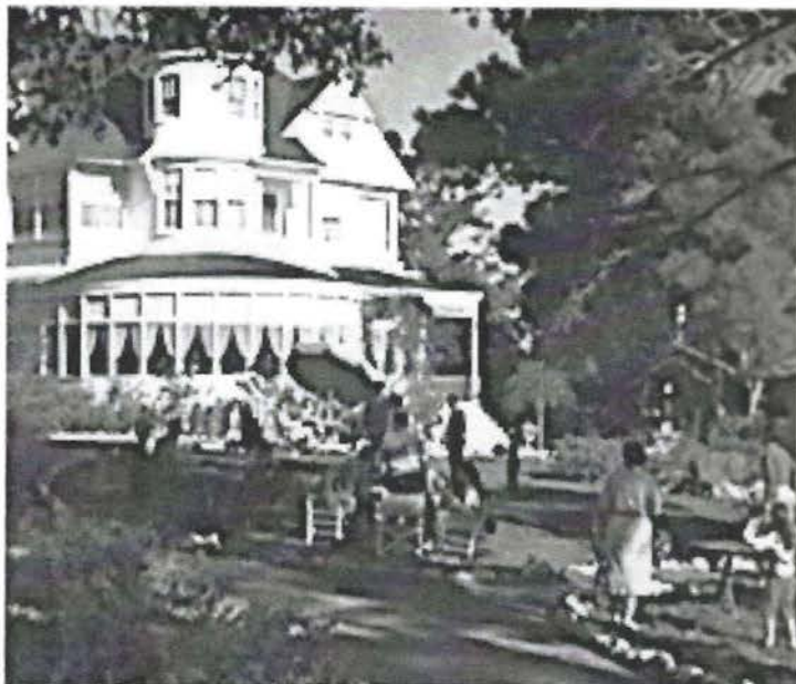
The La Porte Mansion on Lighthouse and 17 Mile Drive. From a publicity still from A Summer Place, 1959

At this point I was just getting warmed up, knew how fascinated—or at least interested—this couple from San Jose must be! I turned,