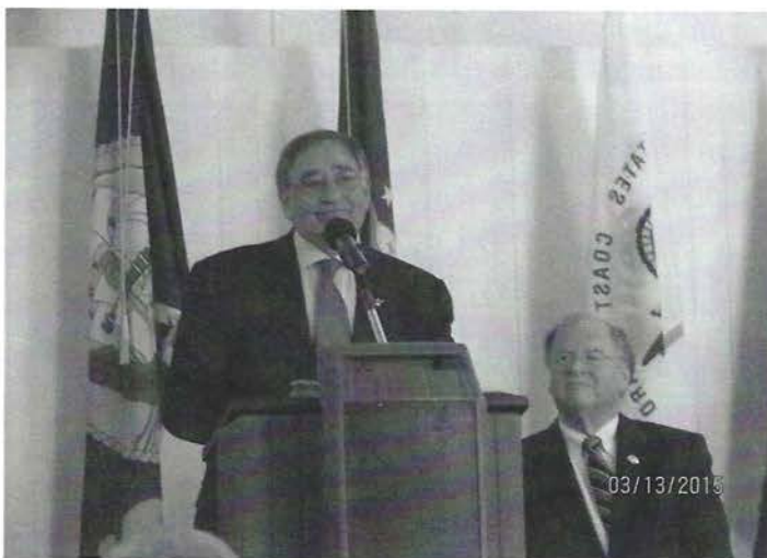
Former Secretary of Defense Leon Panetta addresses the gathering as Congressman Sam Farr listens intently. A Monterey High graduate, Panetta was also Monterey's congressman, President Clinton's Chief of Staff, and CIA Director under President Obama. He served as a lieutenant in the United States Army.

Fort Ord was closed in 1994, and there were hopes to establish a national cemetery for the 100,000 or so eligible veterans in the area. They had all passed through Fort Ord, the Defense Language Institute (formerly the Army Language School) at the Presidio, or the Naval Postgraduate School, and stayed in or returned to the area. However, policy roadblocks and lack of finances prevented the establishment of the cemetery for many years.