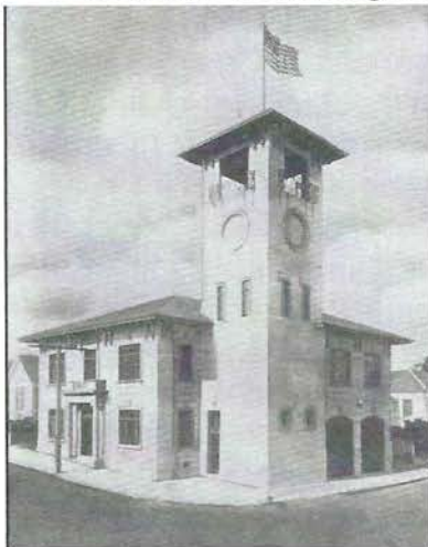
City Hall, circa 1915, from a postcard in the collection of Beth Penney

This is all well and good, but without some