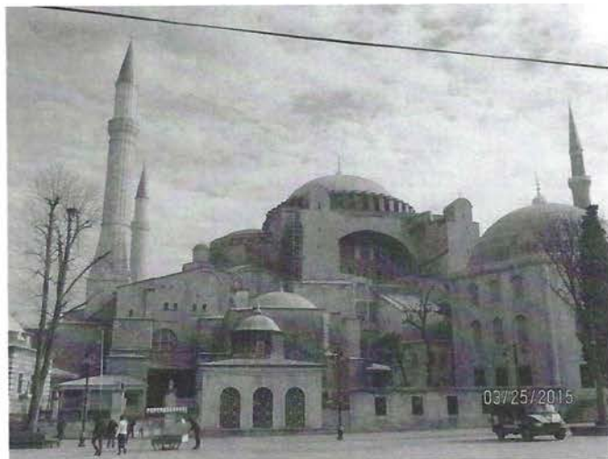
The Hagia Sofia in Cappadocia

In Cappadocia, we visited the Hagia Sofia (which means "holy wisdom" in Greek). This was the world's largest cathedral for a thousand years, then was a Muslim mosque, and now is a state museum.