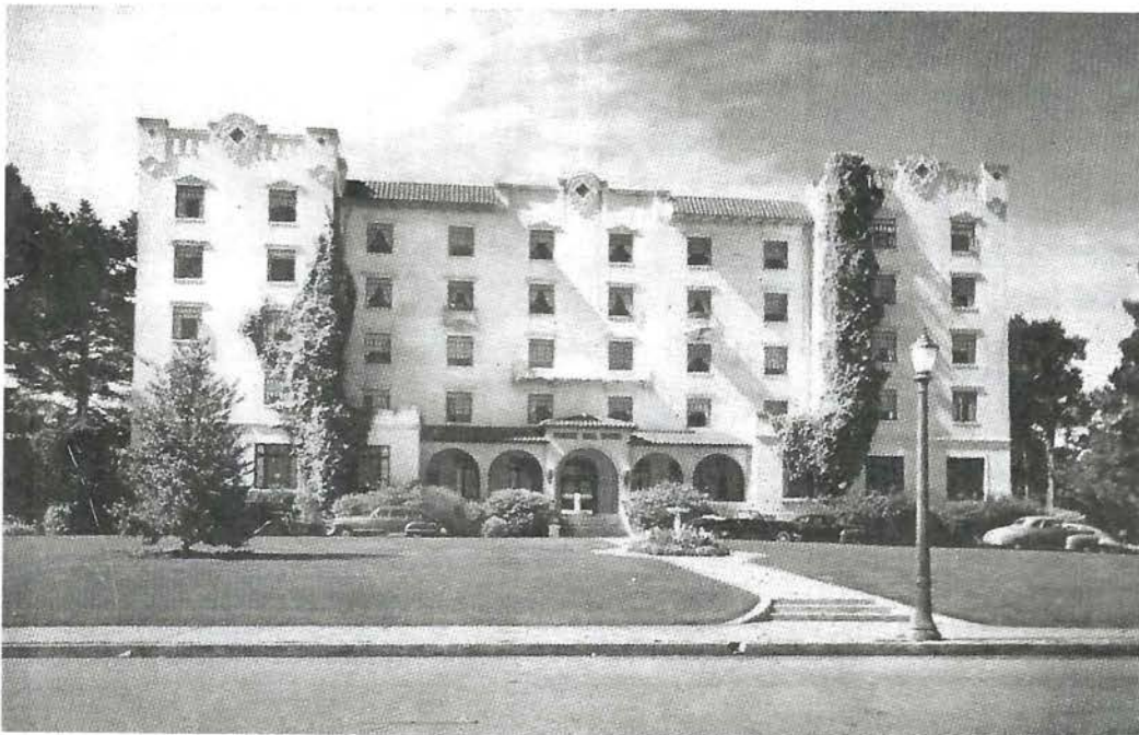
The Forest Hill Hotel—from the cars, late '40s, '50s?

You know I'm getting to the new "Bella" hotel,