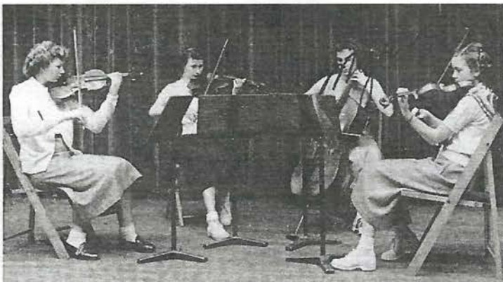
The Pacific Grove High School String Quartet, from the 1949 Sea Urchin